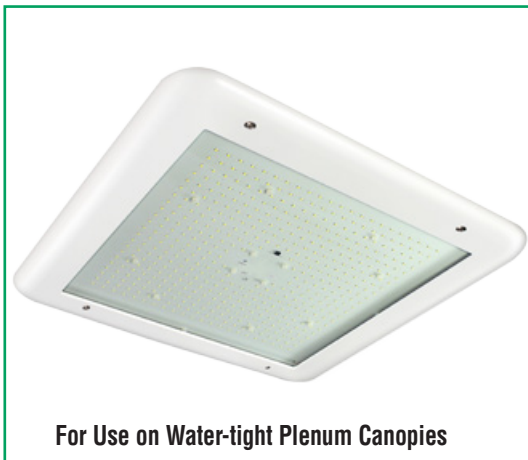
For Use on Water-tight Plenum Canopies