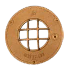
Rock Guard (RGA/B) Lens/Lamp Protection